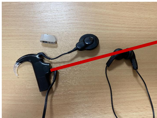
Monitoring Earphone Adaptor

Attach the receiver between the monitoring earphone adaptor and the processor.